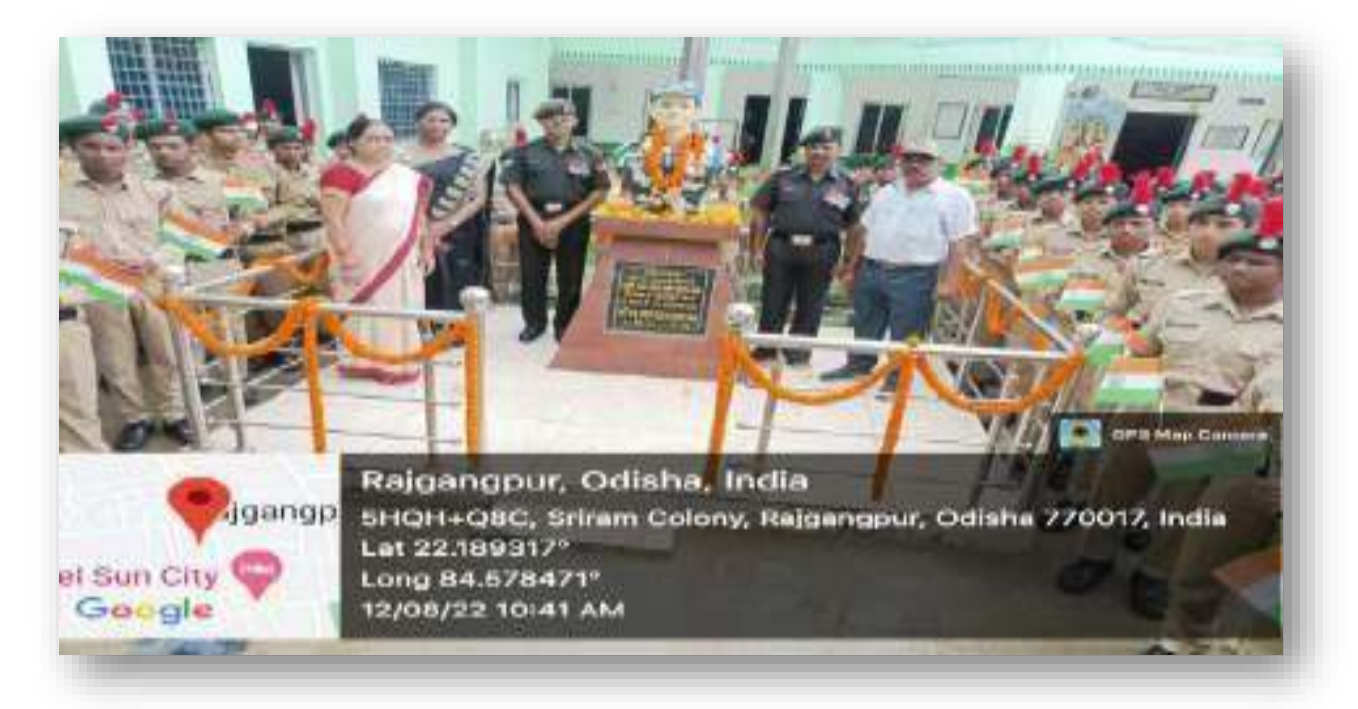
HAR GHAR TIRANGA/ CLEAN INDIA MOVEMENT