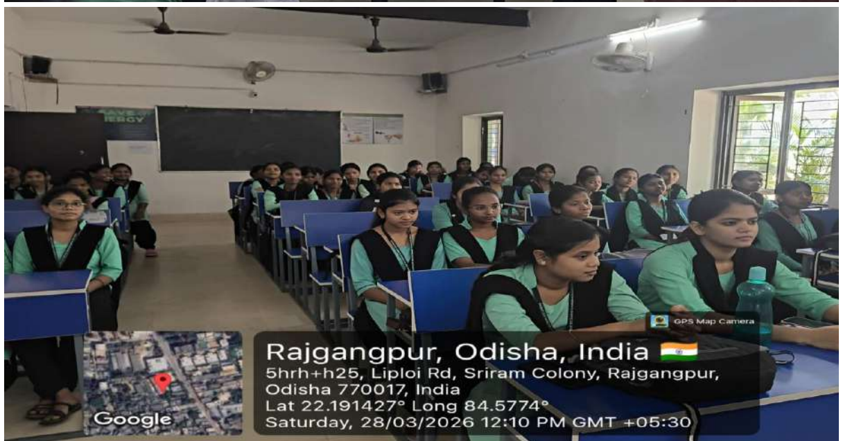
Rajgangpur, Odisha, India 🇮🇳 5hrh+h25, Liploi Rd, Sriram Colony, Rajgangpur, Odisha 770017, India Lat 22.191427° Long 84.5774° Saturday, 28/03/2026 12:10 PM GMT +05:30