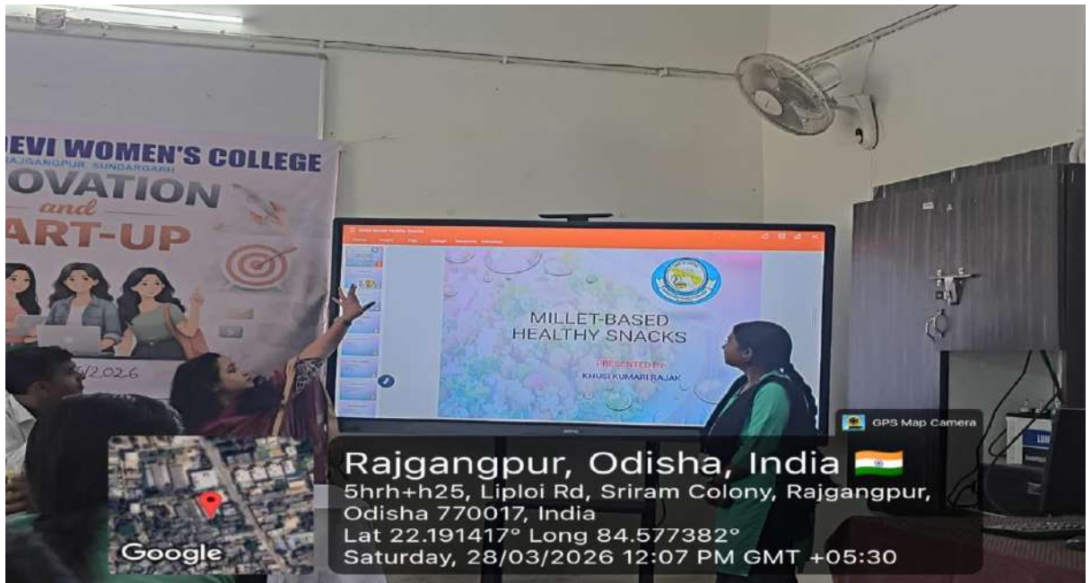
Rajgangpur, Odisha, India 🇮🇳 5hrh+h25, Liploi Rd, Sriram Colony, Rajgangpur, Odisha 770017, India Lat 22.191417° Long 84.577382° Saturday, 28/03/2026 12:07 PM GMT +05:30