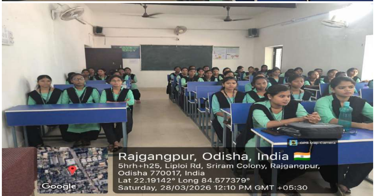
Rajgangpur, Odisha, India 🇮🇳 5hrh+h25, Liploi Rd, Sriram Colony, Rajgangpur, Odisha 770017, India Lat 22.19142° Long 84.577379° Saturday, 28/03/2026 12:10 PM GMT +05:30